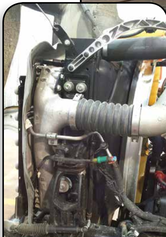
Mack MP8 425M engine

Feedlot Trucks have a tough life... These units see high dust levels and an even higher level of vibration.